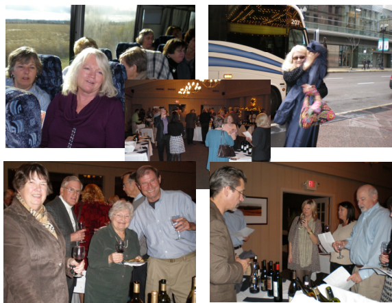
Bus Trip and Wine Tasting 2011